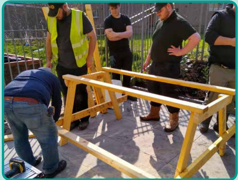
Residents and the Landscaping apprentices learning basic wood workings skills as they build a picnic table in the enhanced back court in the West End of Paisley.

We have worked with students from the Scottish Rural Agricultural College to develop plans for nearby unused green spaces. The first phase saw the team working with residents at our partner, the Blue Triangle Housing Association. Residents attended a woodworking workshop building two picnic tables, decided on which plants they wished in the garden and planted them in their new garden. As at April 19, seven volunteers have benefitted from the project learning new skills and over 30 residents have been involved in developing the Landscape Plans. The project runs to the end of 2019 and will improve the back closes of over 200 homes in the West End.