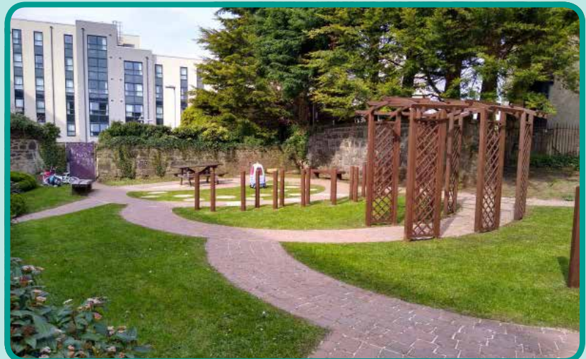
The project has breathed new life into the Secret Garden next to UWS where residents can now enjoy a revamped landscaped area.